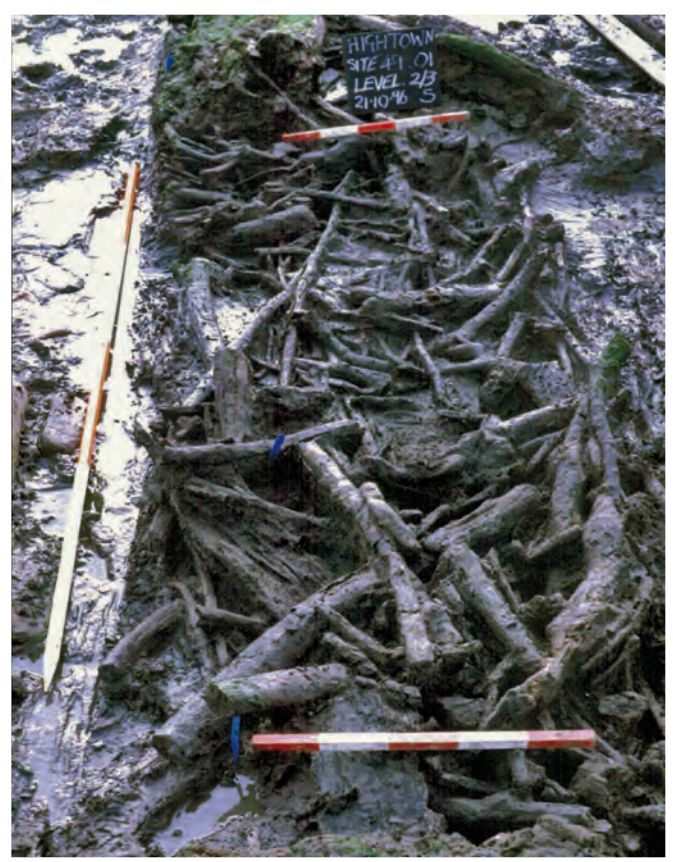
Excavation of early Neolithic wooden trackway at Altmouth by National Museums Liverpool

The earliest evidence for human activity in the area comes from flint tools of the Mesolithic era (middle Stone Age: 5,000 – 9,000 years ago) recovered from the mosslands fringing the river Alt. The people were hunter-gatherers who would have come seasonally from higher land to the east, crossing the moss to take advantage of the rich harvest of fish, shellfish and seabirds on the coast. Animal and human footprints have been discovered on the shore around Formby Point and a wooden track-way, running across what would have been a marshy landscape towards the sea, has been found on the beach at Hightown.