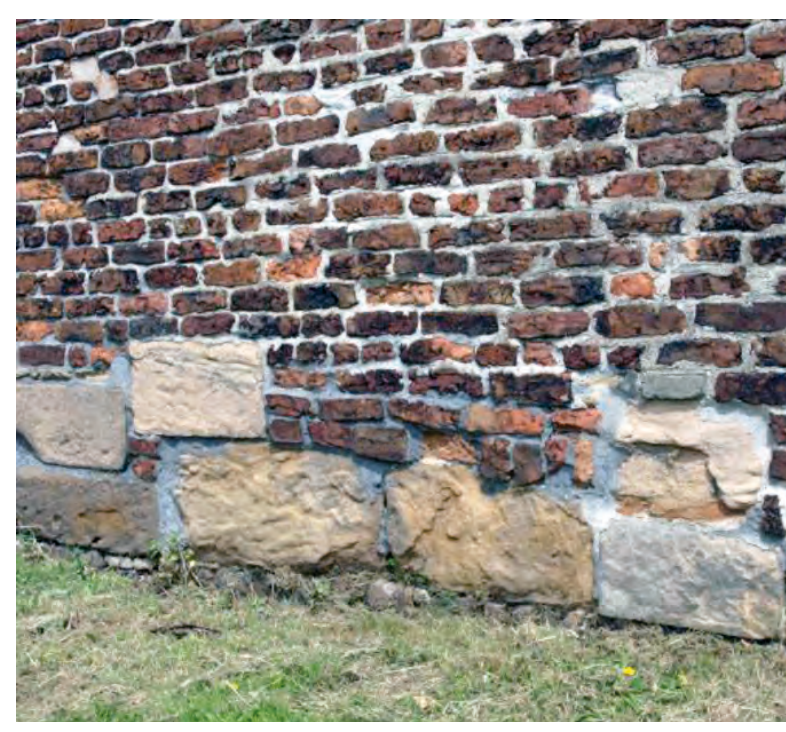
Original sandstone foundations of present-day barn

The remote position of the Grange also made it an ideal landing place for smuggled goods. In the early 18th century, the diaries of Nicholas Blundell of Little Crosby hint at concealment of brandy and wine in the houses of local people including Mr Molyneux of the Grange!