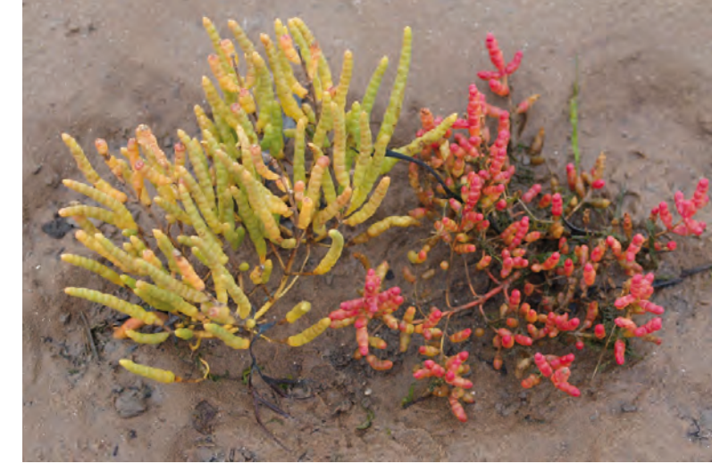
Glasswort (left) (Salicornia dolichostachya) and Glasswort (right) (Salicornia ramosissima)