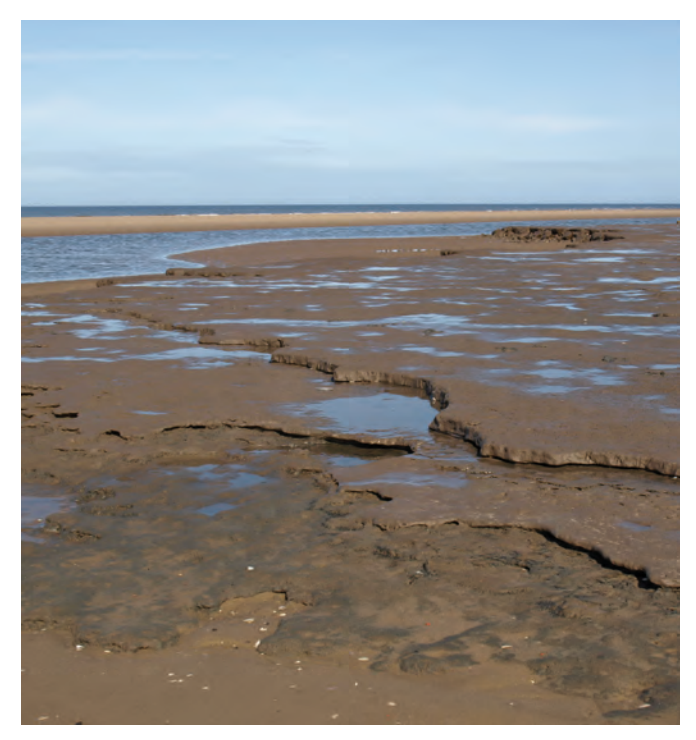
Late Mesolithic (5000 year old) sediment exposed at Formby Point