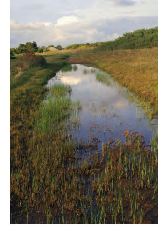
Breeding habitat for Natterjack Toad

The foreshore and dune area is of international importance and is protected as part