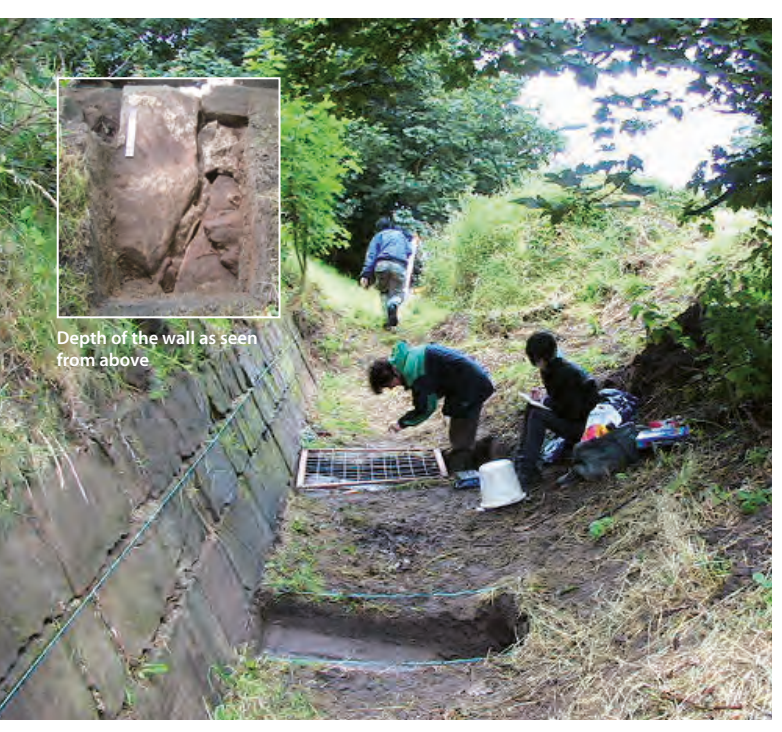
2007 archaeology survey team from King George V College, Southport

At Alt Grange the buildings stand on a low sandy 'island' bounded on the north and west by the meandering Alt and the open sea and with drained mosslands to the east and south. The low-lying lands were subject to flooding and in 1589 a Duchy of Lancaster Commission enquired into the danger of the breakinge oute of the sea banckes called Altemouthe'. It was recommended that the banks should be strengthened by building a stone wall 10 feet high and nearly two-thirds of a mile long at a cost of £600. It is, perhaps the remains of this wall, or of its successor built in the late 18th century as part of the flood prevention measures following the Alt Drainage Act of 1779, that have been discovered a short distance to the west of Grange Farm house. A substantial sandstone revetment, 1.65m wide, rises to a height of 1.2m and runs on a north-south orientation for over 50m. Sandstone flags slope down away from the base of the wall. It was, perhaps, some of this revetment that was exposed and dismantled in 1908 – 1909 when stonework 230 feet long and 6 feet high was removed during dredging 'below Alt Grange'.